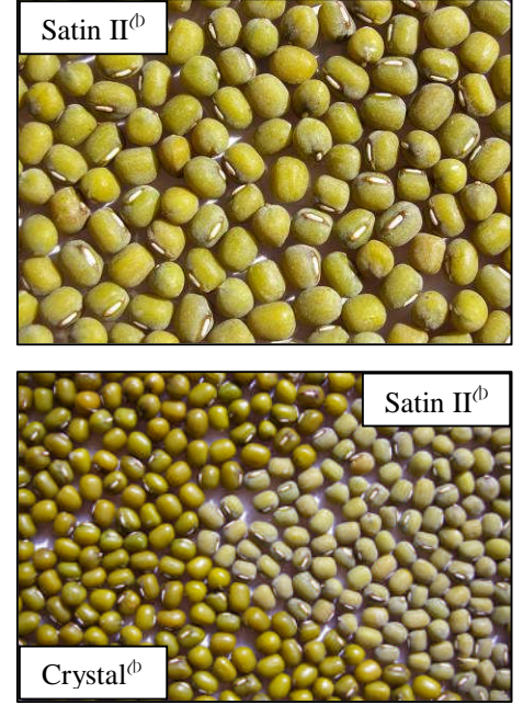
Seed segregation and varietal integrity are critical

Satin II^{(1)} has shown superior seed quality over a diverse range of seasonal conditions with increased seed size when compared to 'Satin' and improved evenness of seed colour, shape and size.